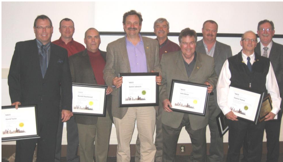
These are the people that we honored on June 3 at the Chamber.