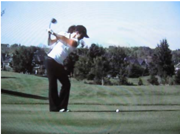
One of our many participants tees off on the Elbow Springs Course.

On behalf of the NACE Calgary Executive, thanks to all golfers who were able to attend this year's event and we look forward to seeing you at next year's tournament.