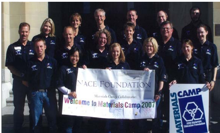
Delegates and Master Teachers for the 2007 Calgary ASM/NACE Materials Camp.

The Calgary Materials Camp was a success for the local Calgary sections of ASM and NACE and the Calgary Materials Camp committee. The camp took 10 months to organize, but the feedback from the participating teachers was extremely positive which made the time and effort very worthwhile. One teacher said: "This is the best continuing education experience I have ever had or heard of – period."